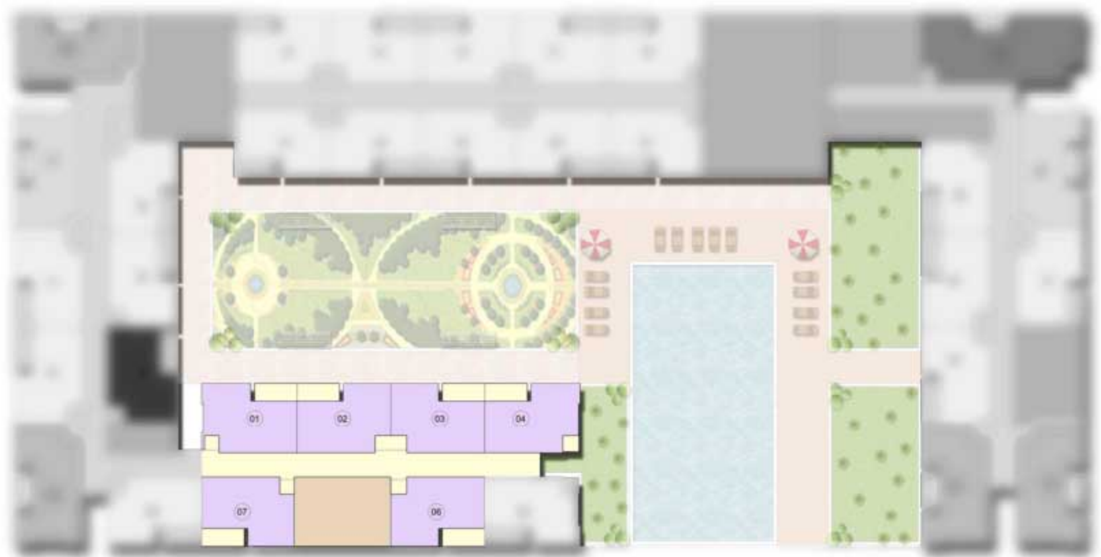
TYPE 1 - 585 SQ.FT. SERVICE APARTMENT